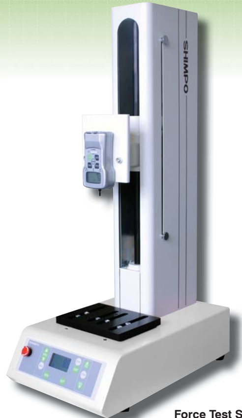
Force Test Stand shown with Force Gauge (Sold Separately)