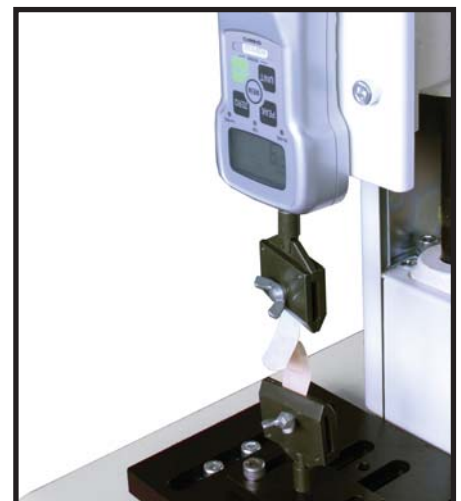
Stand with Optional Grip Performing Peel Test